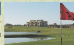
Tarudhan Valley Golf Resort