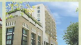
The Peach Tree*