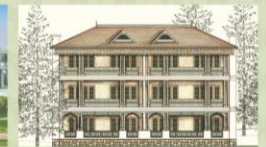
Silverglades Hill Homes*