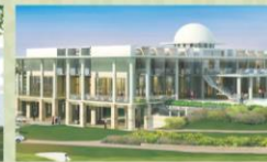
The Imperial Golf Estate*