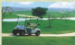
Classic Golf Resort*