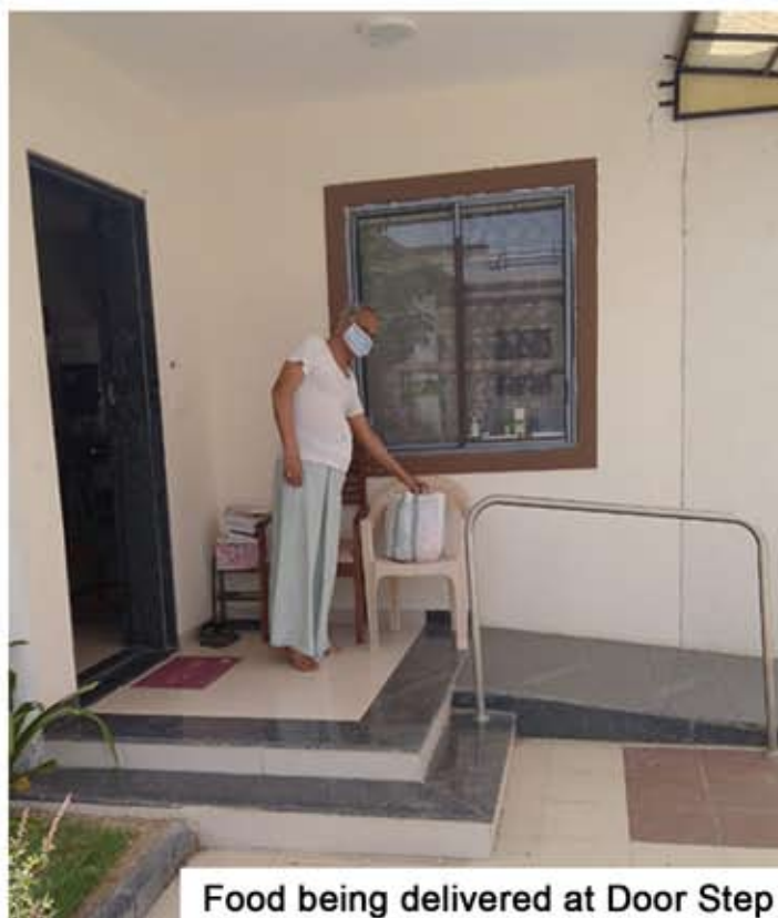
Food being delivered at Door Step

[22/03, 14:24] +91 94262 85655: I am posting messages first time in this group and that too crucial time, only to boost confidence of team mates and show our gratitude also towards dedicated AVI team.